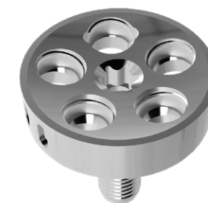
Glenoid baseplate Ti Gr.5 ELI