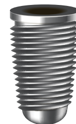
Dental implant Ti Gr.4