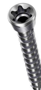
Bone screw Ti Gr.5 ELI