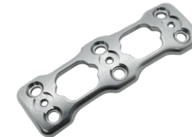
Anterior Cervical Plate Ti Gr.2